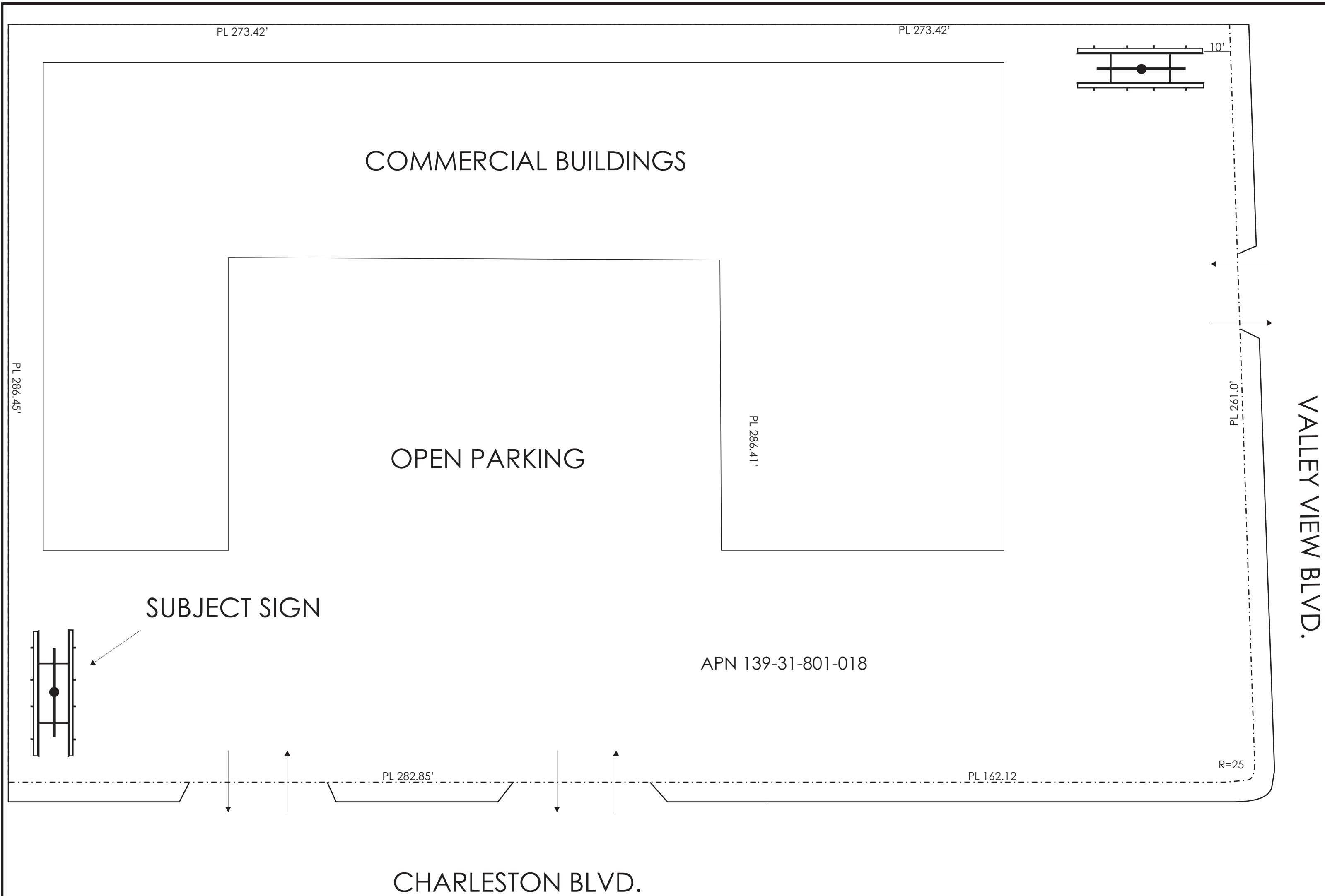
VICINITY MAP (NO SCALE)